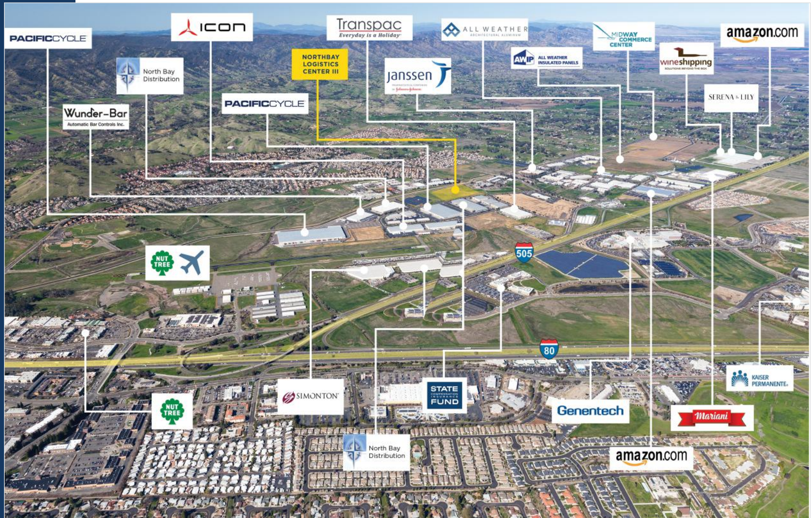
AREA MAP | NEIGHBORING BUSINESSES

BROOKS PEDDER SIOR +1 925 627 2480 brooks.pedder@cushwake.com Lic. 00902154